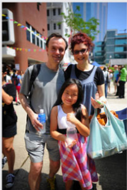
Pastoral Worker (women's & family ministry):