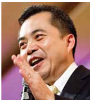
Guest speaker Mr Wong Yan Lung, SC, JP, GBM