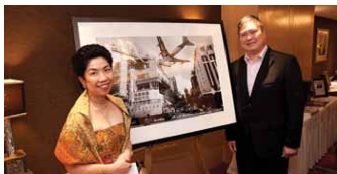
More than 40 items were sold at the silent and live auctions