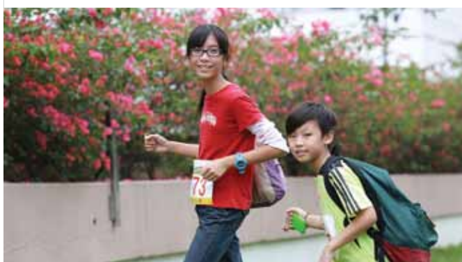
More than 600 people took part in the Discover TST Heritage Challenge in Kowloon Park and St Andrew's Church Open Day