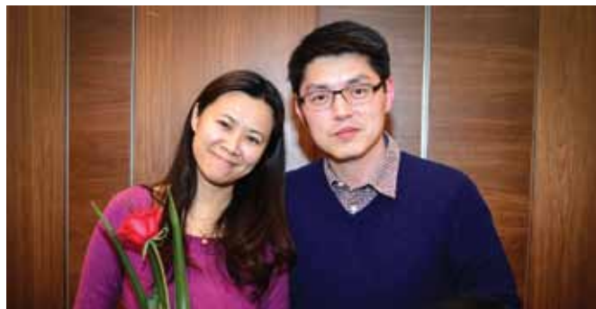
Chinese Valentine's Dinner - a romantic evening

Twenty-five couples enjoyed a romantic evening at the Chinese Valentine's Dinner in February with live music, nice food and fine wine at the Hong Kong Club. They also had fun getting to know each other better through some couples' games.