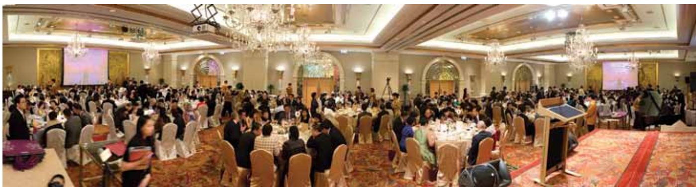
The biggest fundraising event of all time - 'Sharing Our Heritage' Fundraising Gala Dinner on 10 May 2013 at the Kowloon Shangri-La Hotel